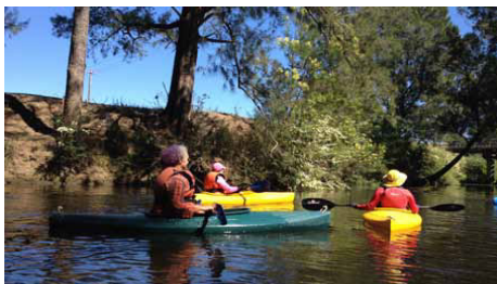
Kayaking near Berry Sport and Recreation Centre

A Fun Weekend in Berry for Older Lesbians Organised by Ten Forty Matrix