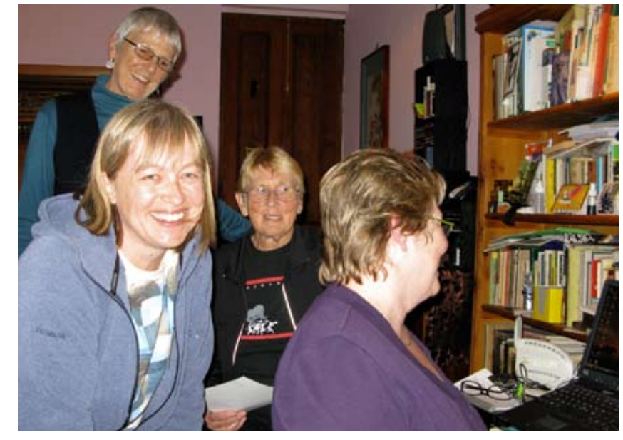
Four websisters hard at work on the new website design

We hope that our website www. olderdykes.org, which has been operating since 2001, inspires lesbians across Australia and the world to contribute ideas, stories and articles about what it's like being an older dyke in the 21st Century!