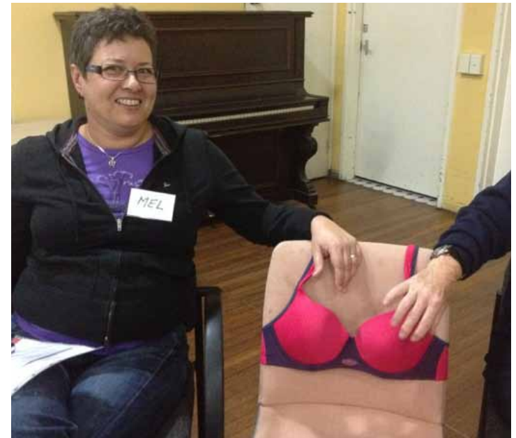
Mel demonstrating the fine art of one handed bra removal

generally agreed that pornography is largely created by men for men, and that it is often themed with violence towards women and domination of women. It was suggested that there is definitely a place for lesbian erotica rather than pornography, both visual erotica and the written word. Some thought that